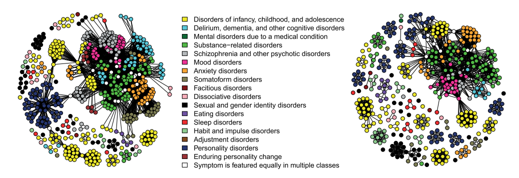
Figure 2. Visualization of the ICD-10 (left) and DSM-IV-TR (right) criteria space. Criteria are represented as nodes and connected whenever they occur in the same disorder. Colour of nodes (middle) signifies the disorder class in which they occur most often. The DSM-IV-TR criteria space is from "The Small World of Psychopathology" by D. Borsboom, A. O. J. Cramer, V. D. Schmittmann, S. Epskamp, and L. J. Waldorp, 2011, Plos ONE, 6, p. 3. Adapted with permission.

Diagnostic criteria do not map onto symptoms uniquely, because some criteria are defined as disjunctions of symptoms. Disjunctive criteria were separated into their constituent parts (e.g. increased activity or physical restlessness was decomposed into two connected nodes). Sometimes, criteria are formulated differently but can still be considered equivalent for present purposes (e.g. hyperactivity and